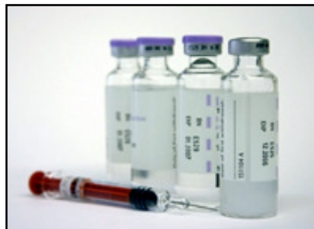
Vials of rabies vaccine

New sections in the updated recommendations include clarification of situations when rabies post-exposure prophylaxis should be administered and information about deviations from recommended vaccination schedule, post-exposure prophylaxis outside the United States, and cost effectiveness of vaccine administration.