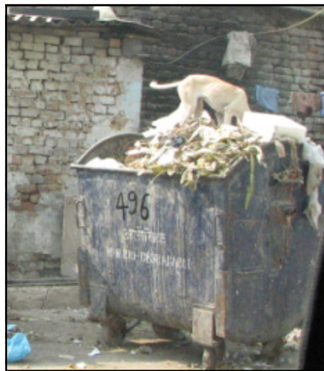
New Delhi, India: Stray dogs are common sights on streets in Asia

In April the National Association of State Public Health Veterinarians issued “Compendium of Animal Rabies Prevention and Control, 2008.” These recommendations are reviewed annually and remain the same for observing and testing animals when rabies is suspected.